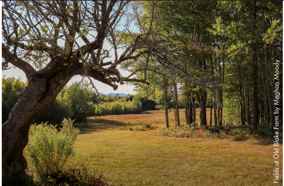
Fields at Old Blake Farm by Meghan Moody

In June 2020, the World Fellowship Center granted three separate conserva-